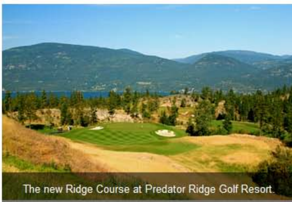
The new Ridge Course at Predator Ridge Golf Resort.

Runner-up: Hamilton Island Golf Club in Australia's Whitsunday Islands: Set on its own island, its setting is spectacular, tip-toeing along the teal waters of the Great Barrier Reef.